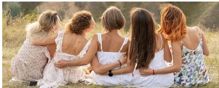
You are Called to be Faithful Friends

" Faithful Friends " supports the Women of the ELCA general fund, which makes it possible for your church-wide organization to act quickly and flexibly in response to any need that may arise.